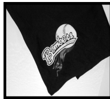
Fleece Blanket Color: Navy Cost: $22.00