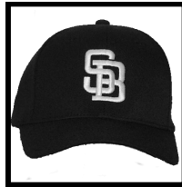
Hat Color: Navy or White Sizes: Youth, Sm-Med, XL Cost: $20.00