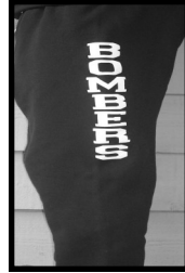
Fleece Sweatpants Color: Navy Sizes: S M L XL Cost: $20.00