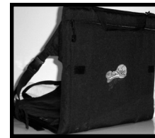
Stadium Seat Color: Black Cost: $30.00

*Dry fit sizes/quantities limited to stock available.