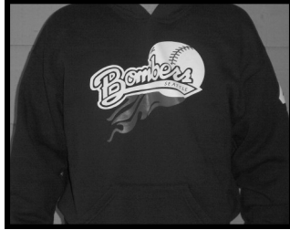
Hooded Fleece Pullover Color: Navy Sizes: S M L XL Cost: $35.00