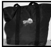
Canvas Bag Color: Black Cost: $22.00