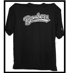
Dry Fit Shirt* Color: Navy Sizes: S M L XL Cost: $25.00