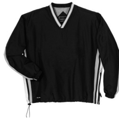
Pullover Color: Navy Sizes: S M L XL Cost: $55.00